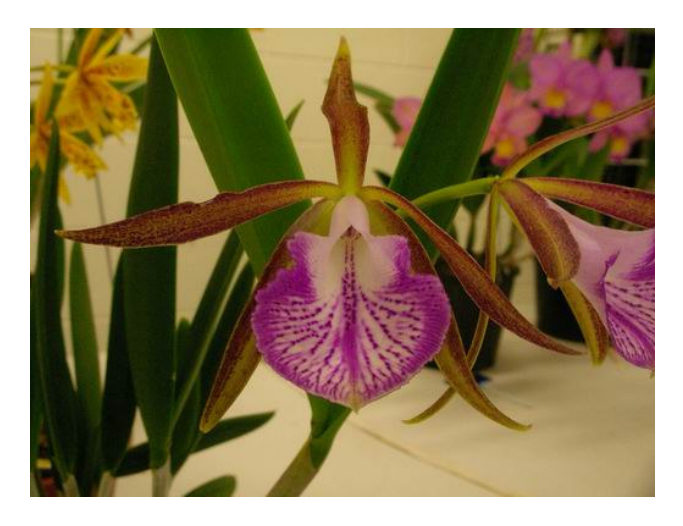
B. nodosa x C. Leopoldii var. alba