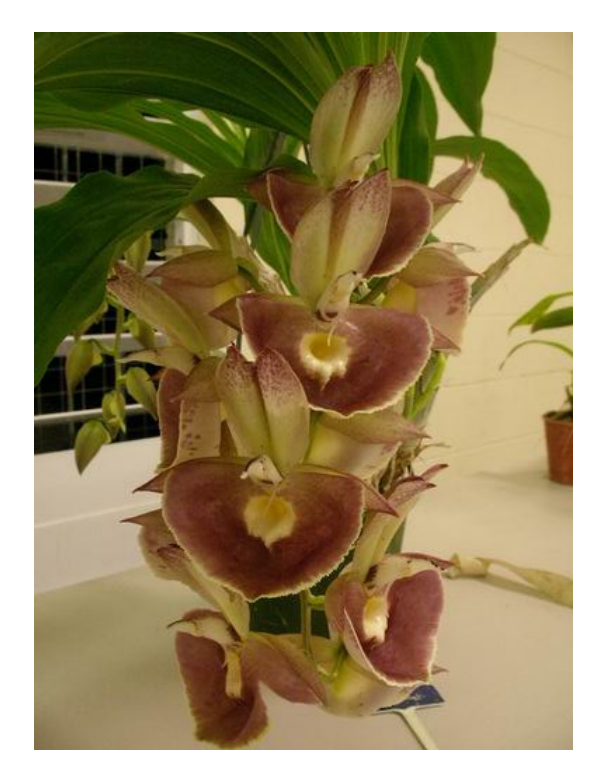
Ctsm. pileatum 'Snowwhite' x expansum 'STD'