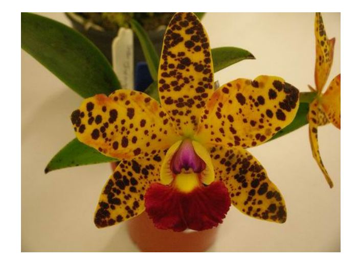
Sc. Jungle Gem 'Darby'