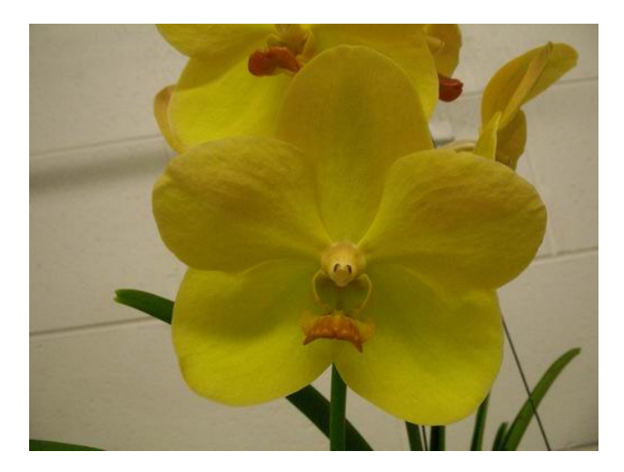
V.Penang Manila x V. Aurawan 'Yellow Bird'